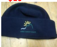
a. Fleece Hat