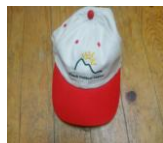
d. Red Hat