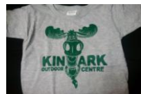
f. Green Moose, sizes 2T - 4T