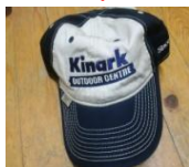
b. Blue Hat